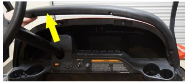
Step 2 : Insert dash, bottom side first into the space behind the tee holders.

NOTE : On most carts, the top of the dash will easily rest against the trim area. If it does not, trim the brow slightly.