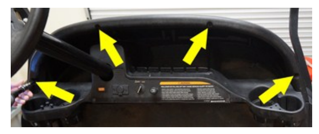
Step 1 : Remove dash trim by removing the (4) Torx Bolts holding it in place. Retain hardware and trim.